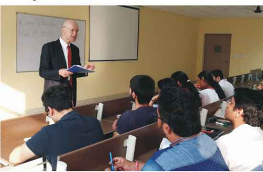
Dean, Faculty & students of SoL, GDGU at Global Law Dean's Forum