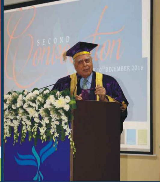
Shri. Kapil Sibal, Senior Advocate, Supreme Court of India at the GDGU campus