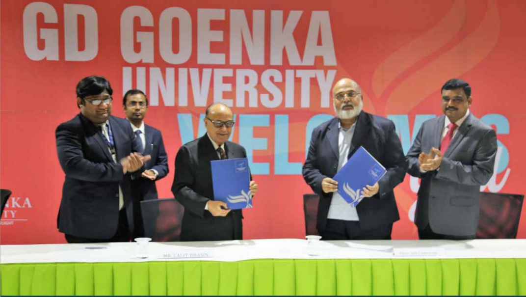
MoU executed between CIArb, India and School of Law, G D Goenka University